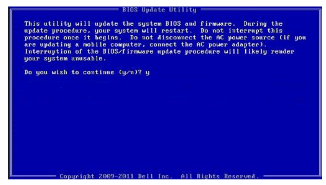
Figure 1. DOS BIOS Update Screen