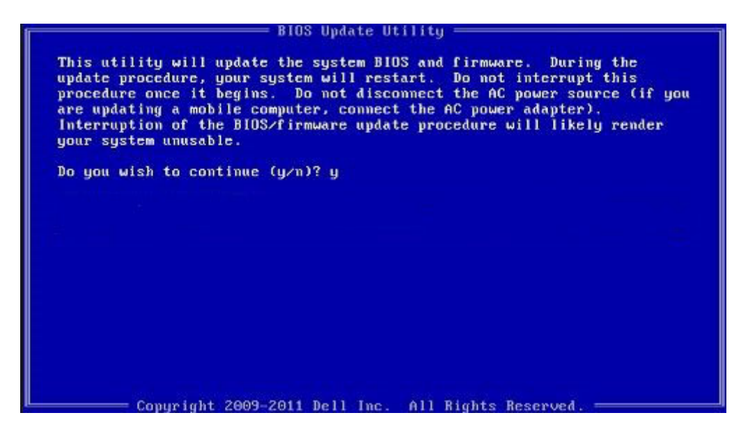
Figure 1. DOS BIOS Update Screen